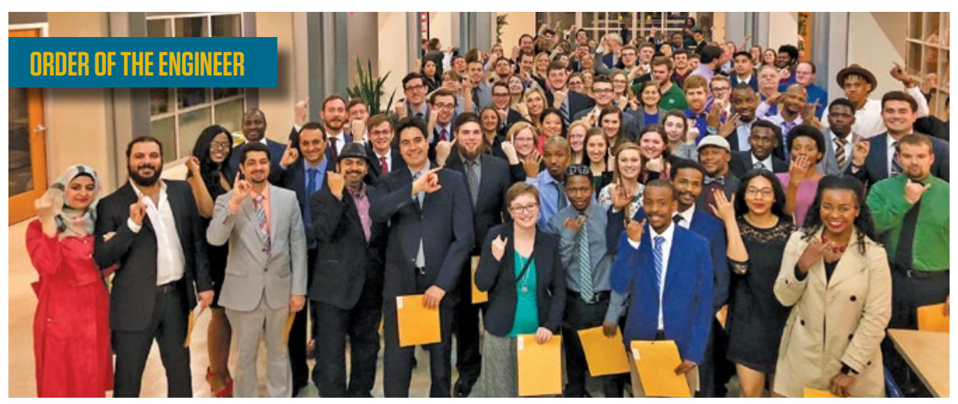
100 S&T Engineers accepted the Obligation on April 24, as part of the Order of the Engineer.