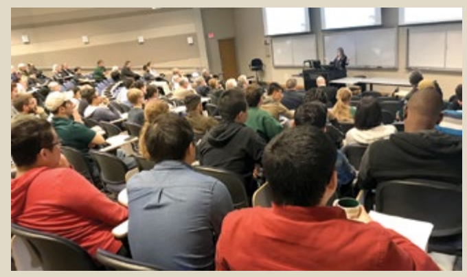
2018 Stueck Lecture